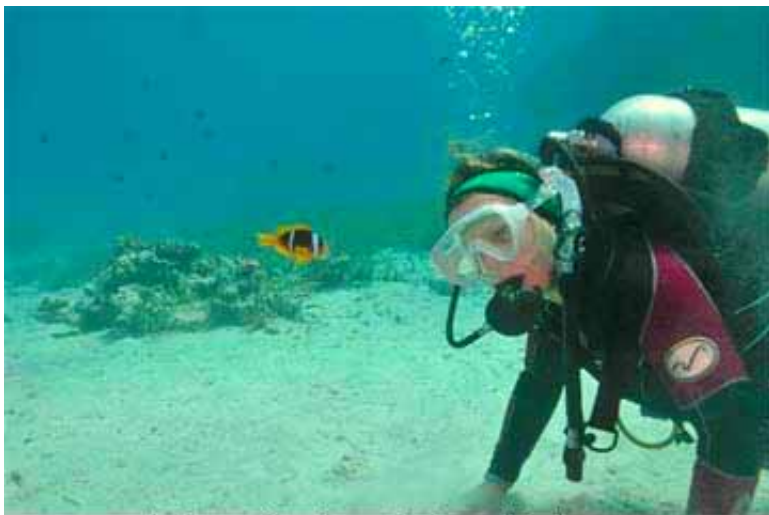
Mrs G with friendly clownfish 'Dolphihouse'

There is also no shortage of people with Rhibs who speed over to any dsmb to pick up surfacing divers!