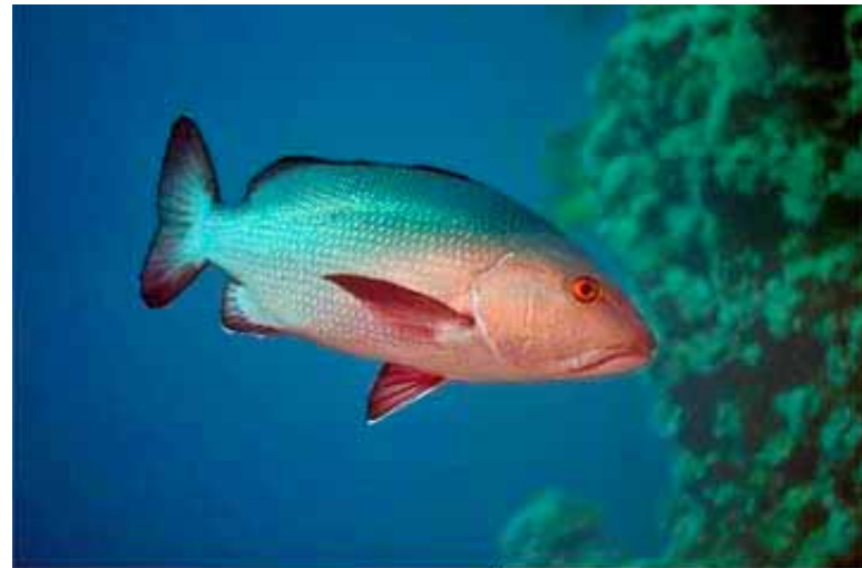
Twin Spot Snapper 'Marsa Alam'

I managed eleven dives (my wife a few less as she isn't so fanatical as me