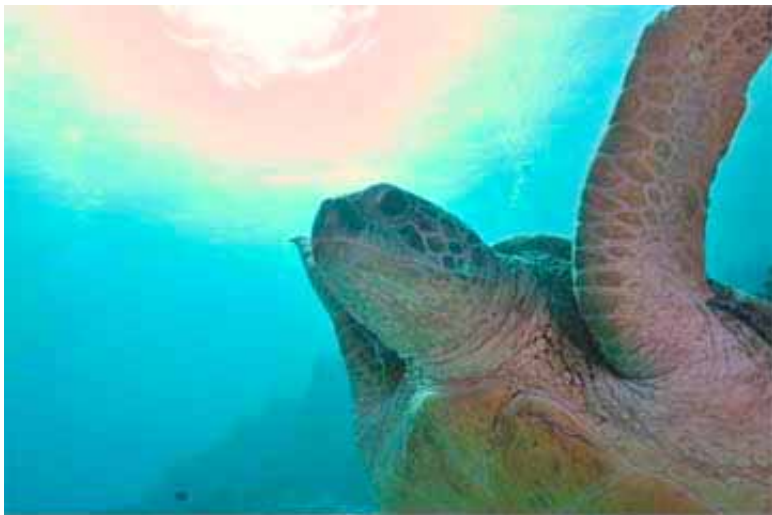
Turtle and Sunburst

dive guides themselves are grateful - if you go out on a boat they can stay onboard and just pick you up when you surface. It must help enormously with their accumulated nitrogen loading.