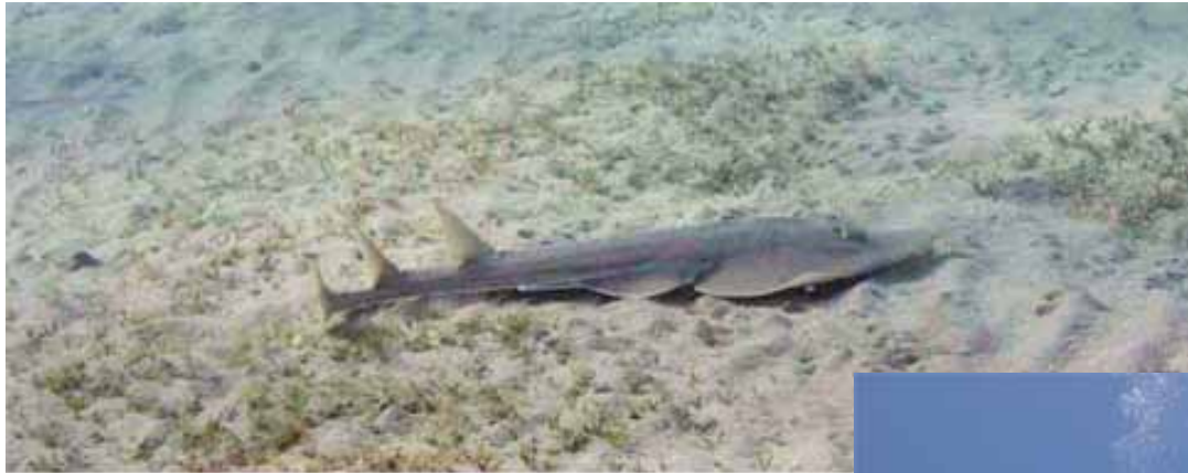
Guitar Shark - Abu dabab

Coraya Divers, a German outfit manned mainly by Egyptian instructors and dive leaders handled the local scuba activities. It was efficient enough if a bit impersonal.