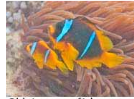
Old Anemone fish

a semi dry. Later in the year the water becomes much clearer and warmer, and a 'T' shirt and trunks are sufficient thermal protection.