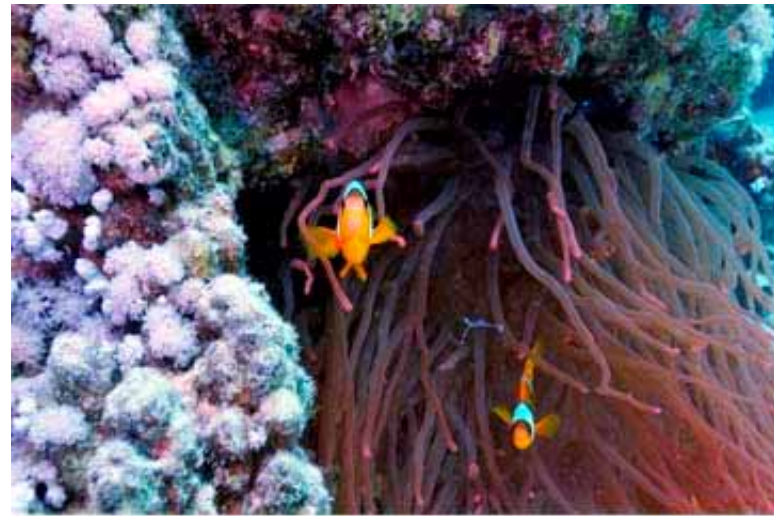
Anemonefish & Coral

dive guides themselves are grateful - if you go out on a boat they can stay onboard and just pick you up when you surface. It must help enormously with their accumulated nitrogen loading.